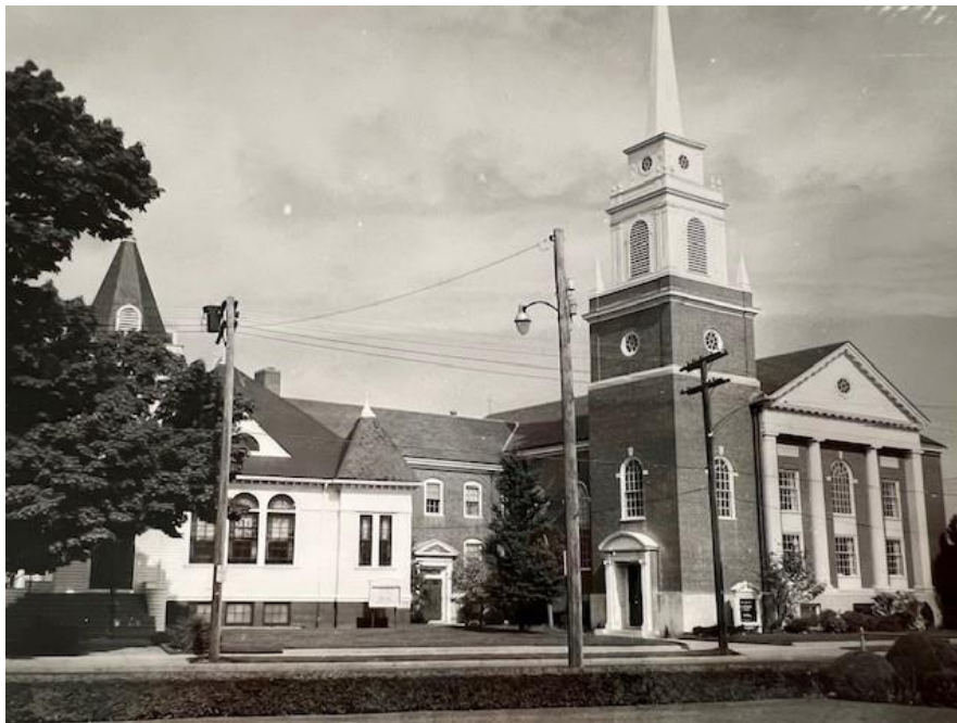
(Here's the church with no elevator lobby or crosswalk signal!)

Do you know that for the first 80 years of PMBC's life there was no stop light out front? Thanks to Peg Chatellier's taking it to the city council, we got our very own safe passage from the market across the street (then the Star Market) in 1980! Members with initiative make profound differences!